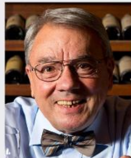
Wolf Blass AM